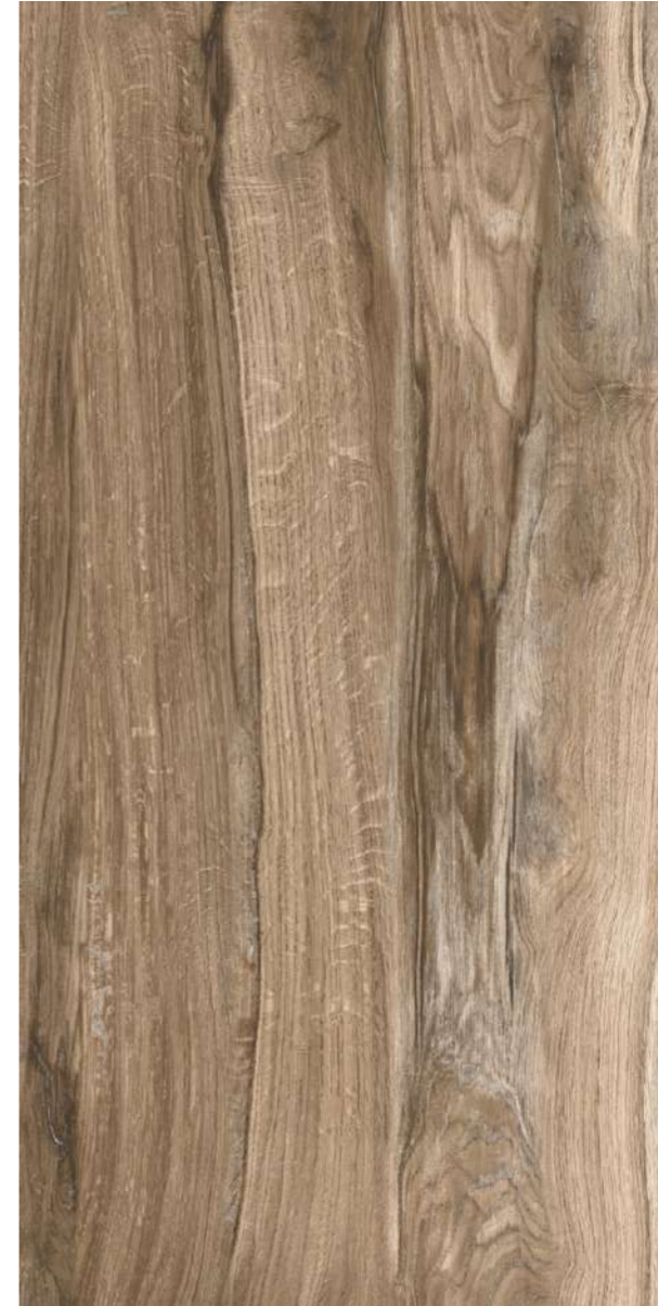
WALNUT WOOD NATURAL