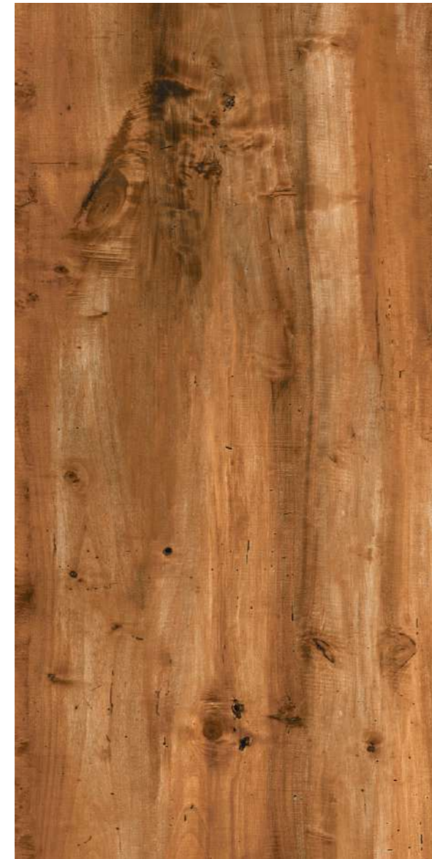
LUMBER WOOD WENGE